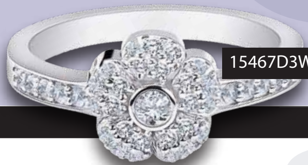
15467D3W, 0.33 cttw