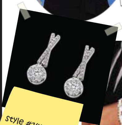
style #14449D4W 0.74 cttw