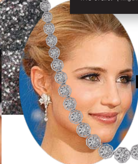
style #13871D4W, 5.36 cttw